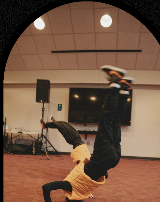
HIP HOP DANCE CREW