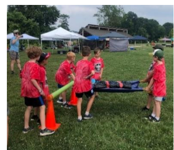
Scouts descended the climbing wall, made several cool projects at the arts & crafts station, and enjoyed the field games.