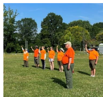
A well-deserved thank you to 30 Staffers for putting on the BEST and LARGEST Cub Scout Day Camp in the National Capital Area Council.