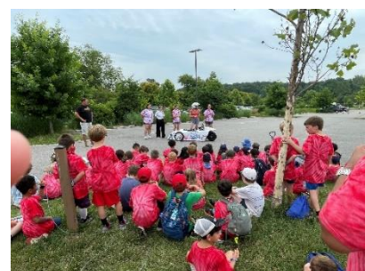
The Wheaton High School Society of Women Engineers raced their all-electric car for the Scouts.

Later in the week, the WOW WHEELZ Driving Academy stopped by and the Scouts were actually able to drive several different types of vehicles on their own.