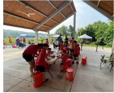
Scouts sailed the boats they made in a Raingutter Regatta, launched stomp rockets, and learned about nature and STEM.