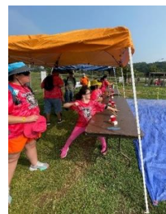
Scouts learned about the importance of Leave No Trace, participated in archery, and hit many of the targets at the Sling Shots station.