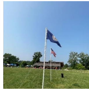
Each Day, Scouts participated in an opening and closing flag ceremony.