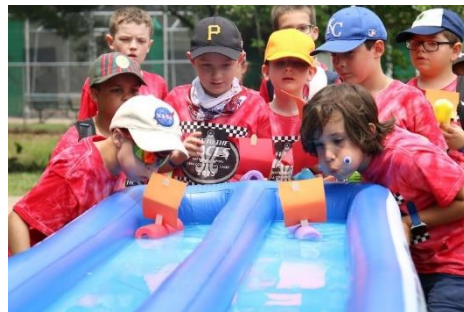
Field games fun and Raingutter Regatta racing.