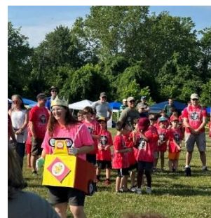
The camp was visited by many special guests.