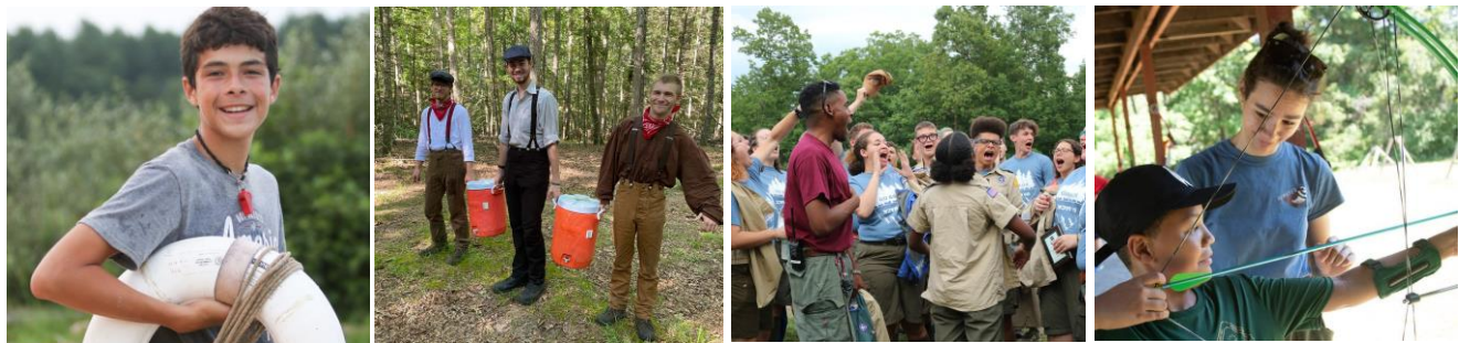
Ross • Olmsted • Marriott • Bowman • Lenhok'sin • Post

Every year, the six camps of Goshen Scout Reservation employ close to 300 highly motivated individuals to participate in the experience of a lifetime.