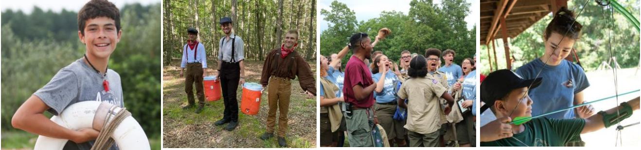
Ross • Olmsted • Marriott • Bowman • Lenhok'sin • Post

Every year, the six camps of Goshen Scout Reservation employ close to 300 highly motivated individuals to participate in the experience of a lifetime.