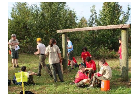
COPE Course Challenges and Fun