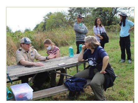
Some of the Many Scouters Supporting the Camporee