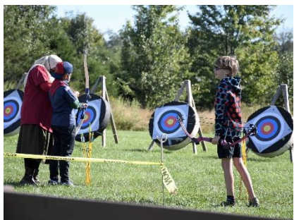
Having Fun at the First Ever Patriot District Cub-o-Ree