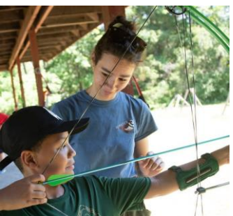
Ross • Olmsted • Marriott • Bowman • Lenhok'sin • Post

Ever year, the six camps of Goshen Scout Reservation employ close to 300 highly motivated individuals to participate in the experience of a lifetime.