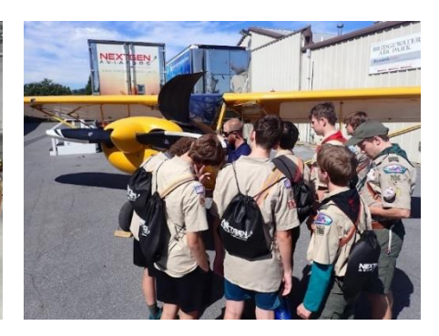
Experienced aviators will provide hands-on opportunities to practice professional skills used in aviation. Scouts will experience hands-on aircraft maintenance labs learning how aircraft are built and maintained.