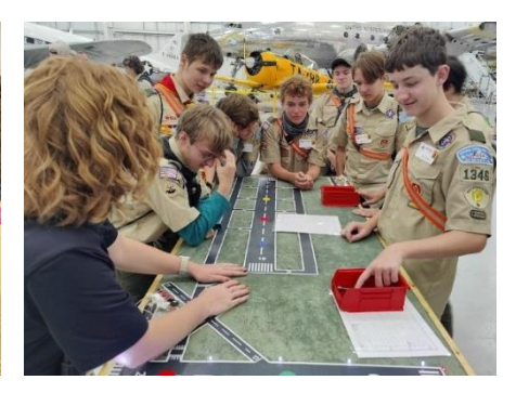
Scouts will talk with experts and learn valuable information about the world of aviation. They will experience the thrill of guiding a plane through the skies in desktop simulators.