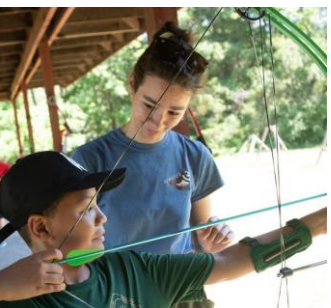
Ross • Olmsted • Marriott • Bowman • Lenhok'sin • Post

Ever year, the six camps of Goshen Scout Reservation employ close to 300 highly motivated individuals to participate in the experience of a lifetime.