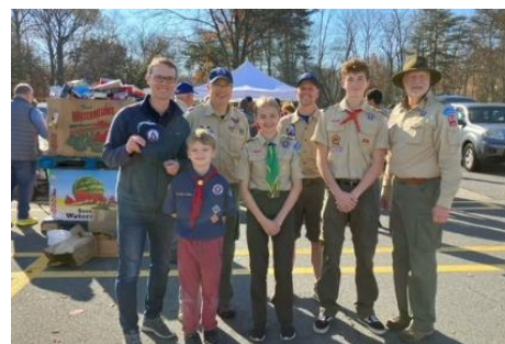
Some of Our Many SFF Volunteers

Over 25 Patriot District BSA Packs and Troops pulled together for the annual Scouting for Food service project in November. On November 5 th , Cub Scouts and Scouts BSA delivered thousands of 'post-it note' type stickers and did a great job adapting to filling in the collection day on this year's stickers that lacked the date. On the following Saturday, units organized to scour the neighborhoods and gather donations. Patriot District's combined efforts resulted in 30,000 pounds of food donated to the Capital Area Food Bank and local church food pantries for people in need. Congratulations to all the youth, leaders and parents who helped make this a very successful food drive important to our local community.