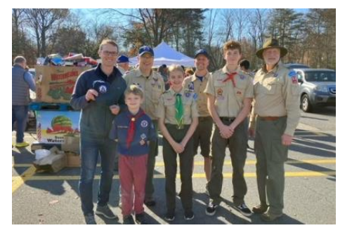
Some of Our Many SFF Volunteers

Over 25 Patriot District BSA Packs and Troops pulled together for the annual Scouting for Food service project in November. On November 5<sup>th</sup>, Cub Scouts and Scouts BSA delivered thousands of 'post-it note' type stickers and did a great job adapting to filling in the collection day on this year's stickers that lacked the date. On the following Saturday, units organized to scour the neighborhoods and gather donations. Patriot District's combined efforts resulted in 30,000 pounds of food donated to the Capital Area Food Bank and local church food pantries for people in need. Congratulations to all the youth, leaders and parents who helped make this a very successful food drive important to our local community.