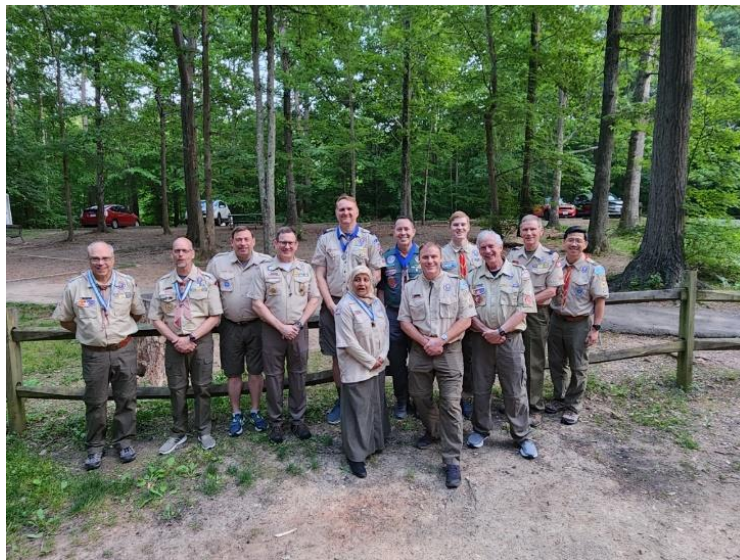
Awardees Recognized at the District Court of Honor

Many additional Patriot Spirit and Leader of the Year awards were presented in absentia to other deserving Scouters. Congratulations to all our awardees. Keep your eyes open for news about the 2023 award cycle.