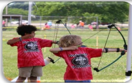
HURRY – Early Bird Registration Ends: April 30, 2024

SIGN-UP HERE: https://scoutingevent.com/082-78675