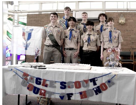
The New Eagle Scouts with Two Celebration Cakes